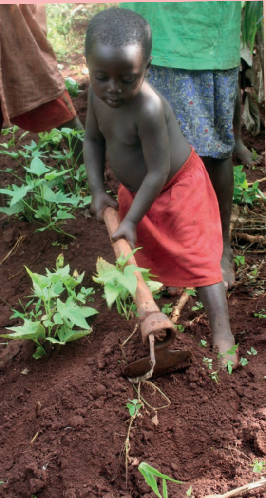
Young children were forced into child labour

Before Covid, Save the Children estimated that: