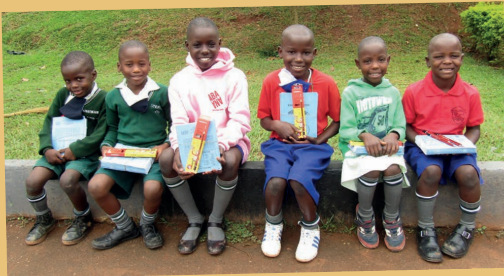
P1 Pupils from Strathearn Primary

School doors have finally opened once more, albeit with a little concern about how pupils and teachers would cope after such a long gap of classroom learning, but there was an overriding sense of joy at being back at last!