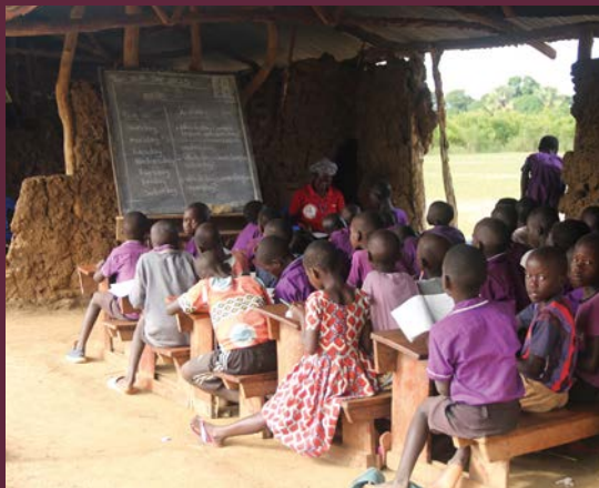
Children at Kadok Primary

Thank you for your continued support, generosity, and prayers. It is exciting to see the impact we can make in Uganda and inspiring to see our children become leaders in their communities. One of our early sponsor children is even running in the local election as an MP!